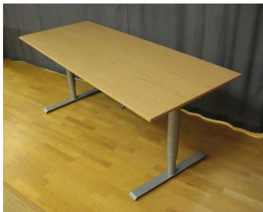
Figure 1 Lanab Design Ergofunk II work table.